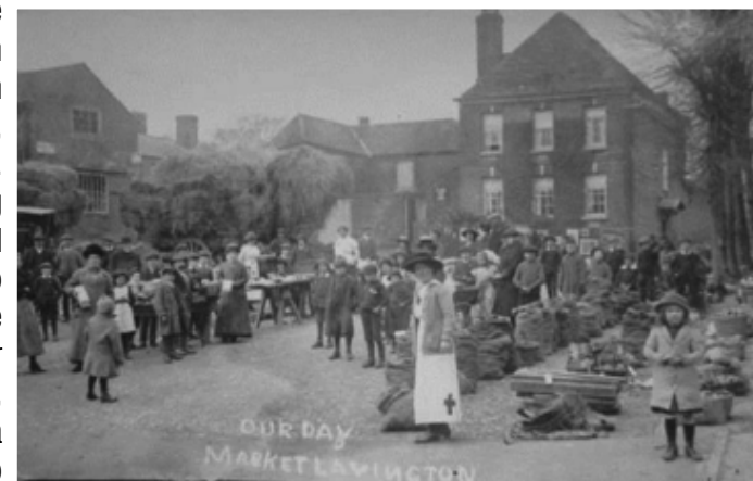
Our Day, Market Lavington 1915

The market will take place on Saturday 16th May 2015, 9am-11am in the Market Place, Market Lavington. We are inviting local traders and community groups to run the stalls. There are limited number of spaces available, please contact Emma on 07733 294440 to reserve a space and for more information.